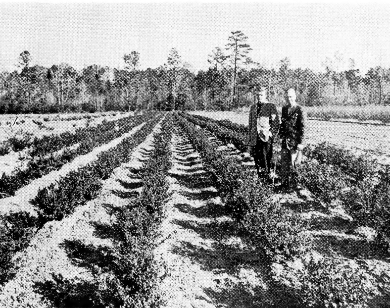
Ilex crenata rotundifolia . Photo. Dec. 18, 1957

1½-2 ft. Regular grade ----- 3.00 1½-2 ft. Select Specimens ----- 4.00